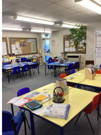
Year 2 Classroom