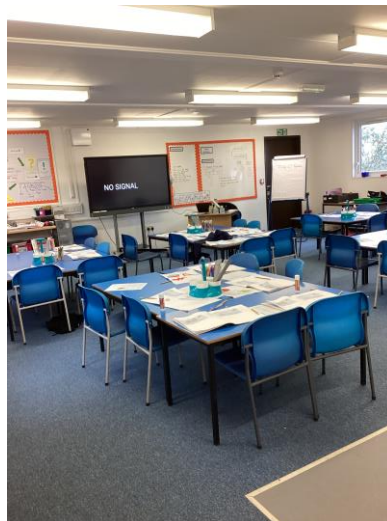
Year 3 Classroom