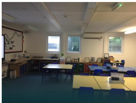
Year 4 Classroom