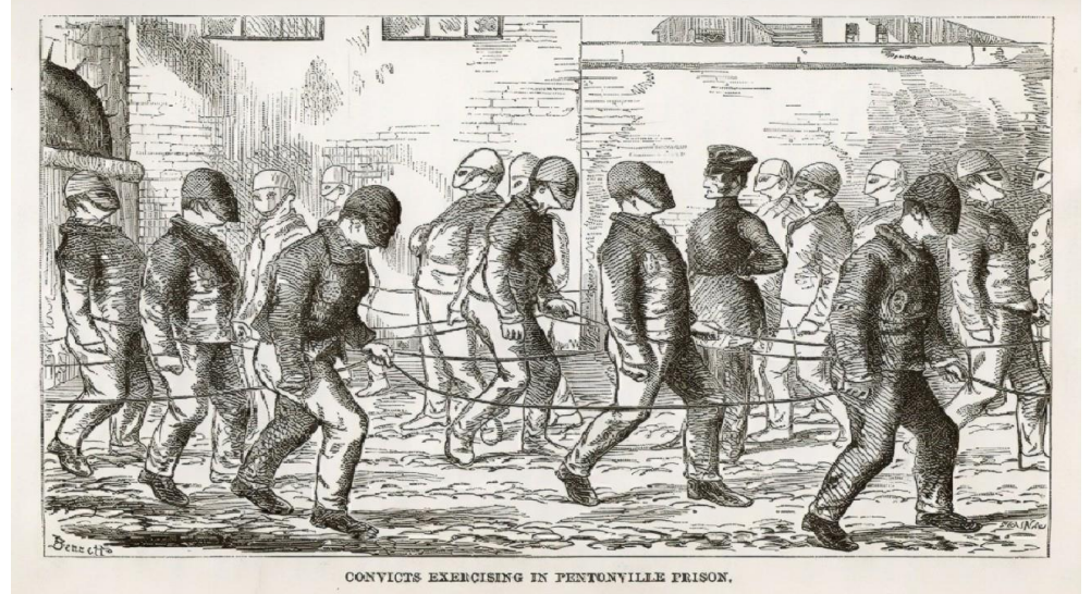
CONVICTS EXERCISING IN PENTONVILLE PRISON.